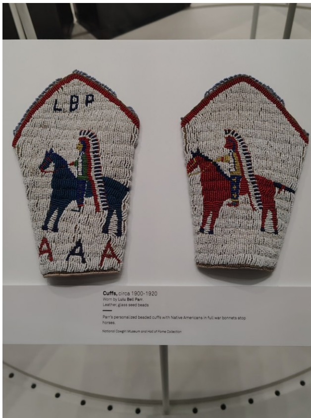
Cuffs, circa 1900-1920