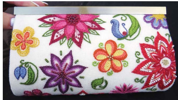
^ Design on back of the clutch