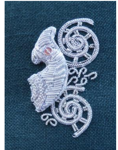
Partially completed silver thread version

Shirley is known for her low stress approach in her workshops.