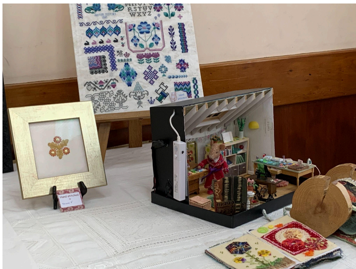
From the display table

We also held the president's meeting this day, and a common theme from all guilds was how to find new members. We all had lots of ideas to share, including Stitch and sip evenings at local coffee shops and pubs, library classes, the A and P shows, school classes, and using social media. If anyone would like help exploring These ideas further, please reach out.